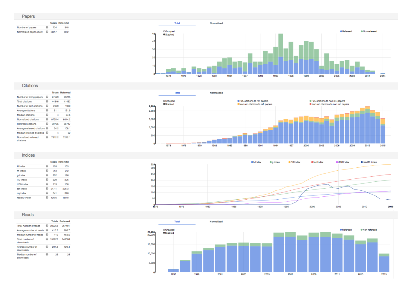
Figure 1. Example of metrics overview